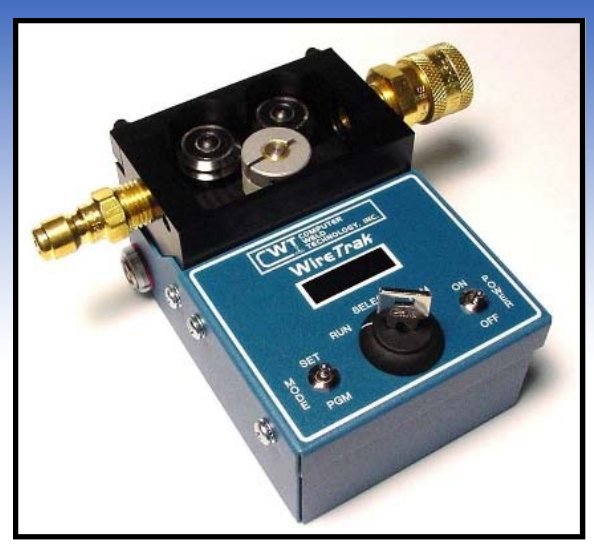
Wire Trak™ - Standard Configuration

The sensor is simple to install at the GMAW wire drive motor inlet using industry standard quick disconnect conduit fittings. The sensor may also be remotely mounted using an industry standard conduit assembly and the optional mounting bracket. A series of display screens are provided to allow the operator or supervisor access to wire feed speed run data and to program the sensor for operation. The Wire Trak™ incorporates a Run/Program selector switch for completion of set-up by operator or supervisor. Once set-up is complete, the key can be removed to ensure no changes are made.