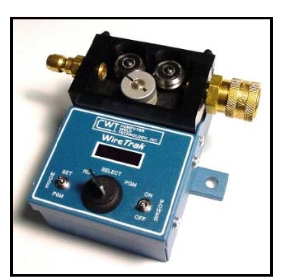
Wire Trak ™ with Optional Mounting Bar Kit

The Wire Trak^{\mathsf{TM}} - the new product from Computer Weld Technology, Inc. for making your welding environment more efficient. By providing the necessary data acquisition; signal processing and communications firmware, the Wire Trak^{\mathsf{TM}} allows remote logging of your wire utilization and actual productivity rates. The Wire Trak^{\mathsf{TM}} is designed for monitoring and telemonitoring service purposes and is based on an embedded micro-controller. The Optional WireLog Plus software offers the ability to program, download data and communicate with multiple Wire Trak^{\mathsf{TM}} units.