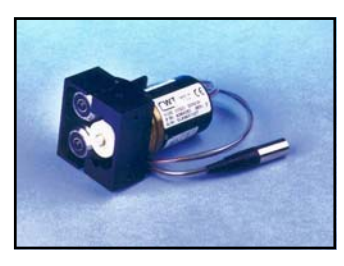
Wire Speed 10-1000 IPM (4.2-423mm/s) ±3%*, 1 IPM (0.4mm/s) resolution